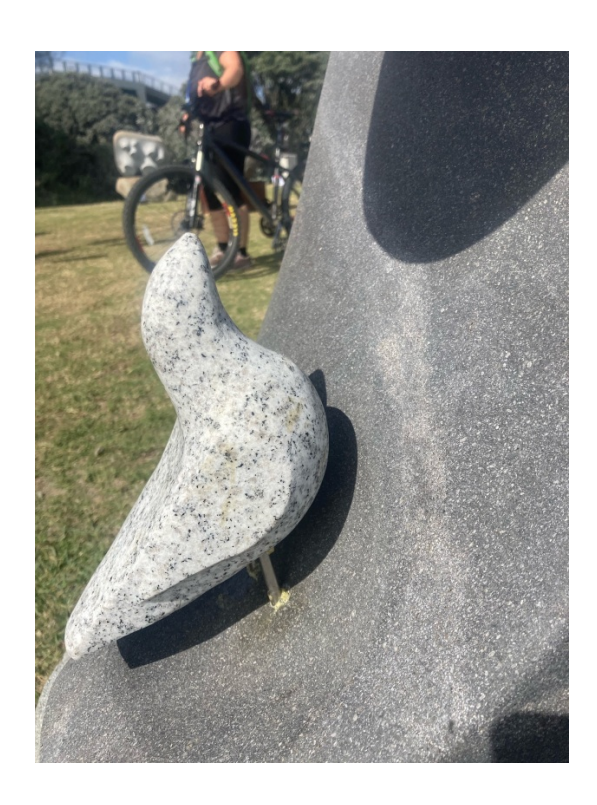
Issues in Caring for Contemporary Stone Art

Must-read tips on caring for your collection from our blog