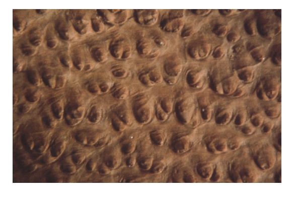
Mould on Leather

We often think of stone as being a hearty material that requires little preservation, but some precautionary measures go a long way!